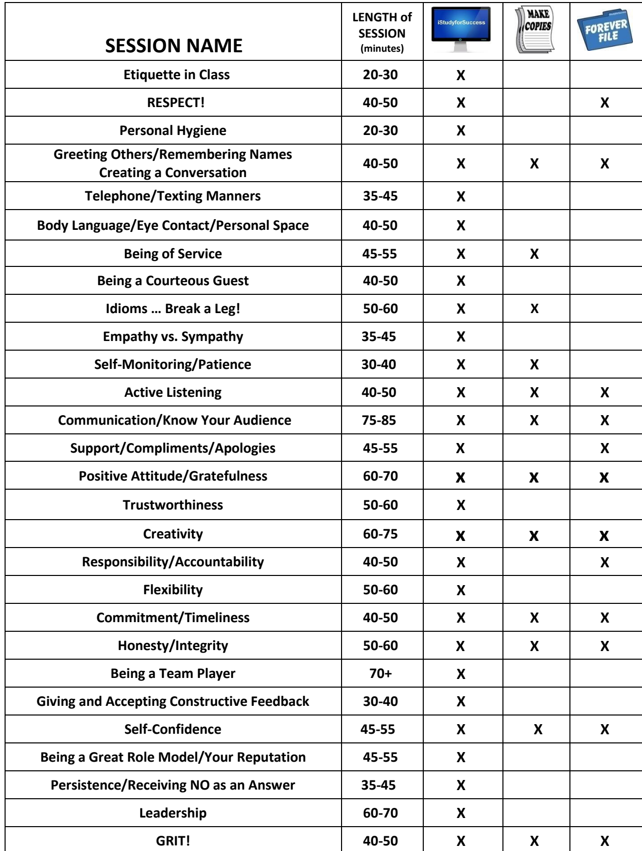
Table of Contents / Social & Soft Skills